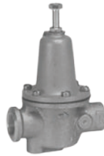
Pressure Reducing Valve